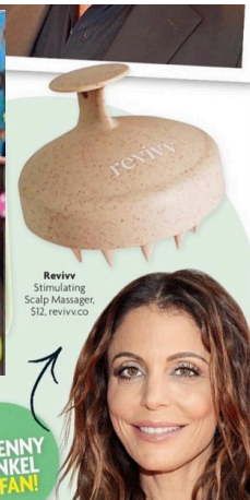
Reviva Stimulating Scalp Massager, $12, revivaco.com