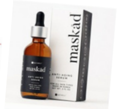
Two serums to work alongside the maskad Anti-Aging Hydrating Serum to visibly improve the appearance of fine lines and uneven skin tone, and sagging skin and a Hydrating Serum